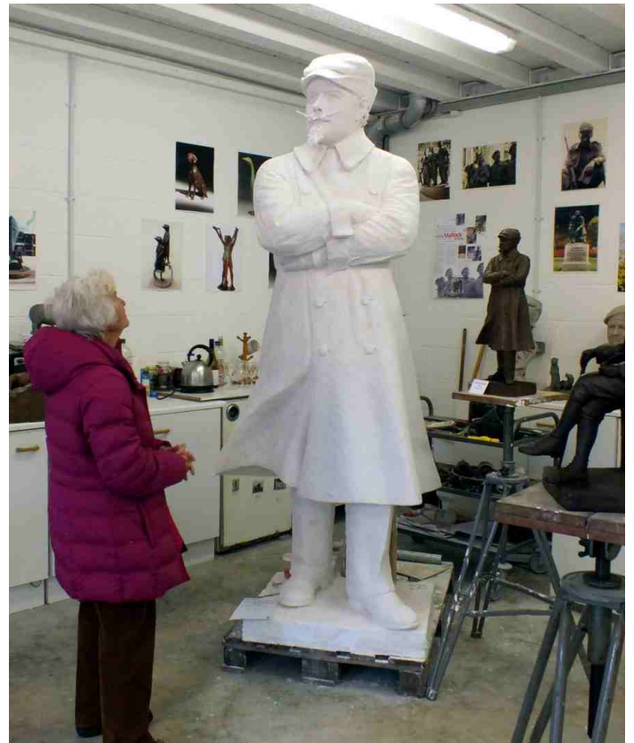
'Cody' by Vivi Mallock

10th November: The National Glass Fair at The National Motorcycle Museum, Solihull