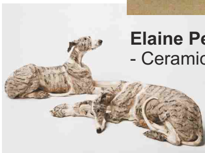
Elaine Peto - Ceramicist