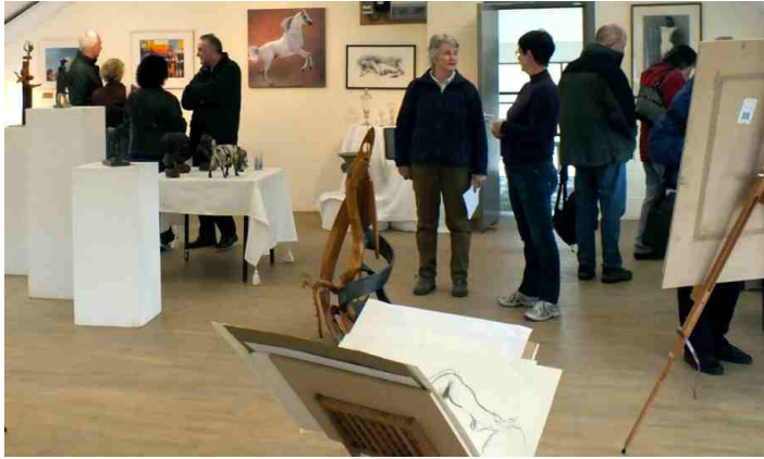
The display in the Life Studio