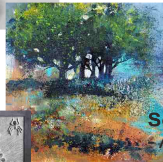
Soraya French - Artist