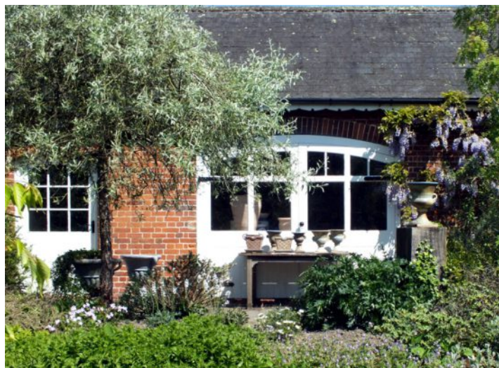
A corner of the garden at Project Workshops, with a view of the Pottery

sculpture. I intend to have this recently completed plaster sculpture cast, and displayed outside. Similar large scale (and some smaller) works focusing on the human form will start to appear during the course of the year, along with some new animal pieces.